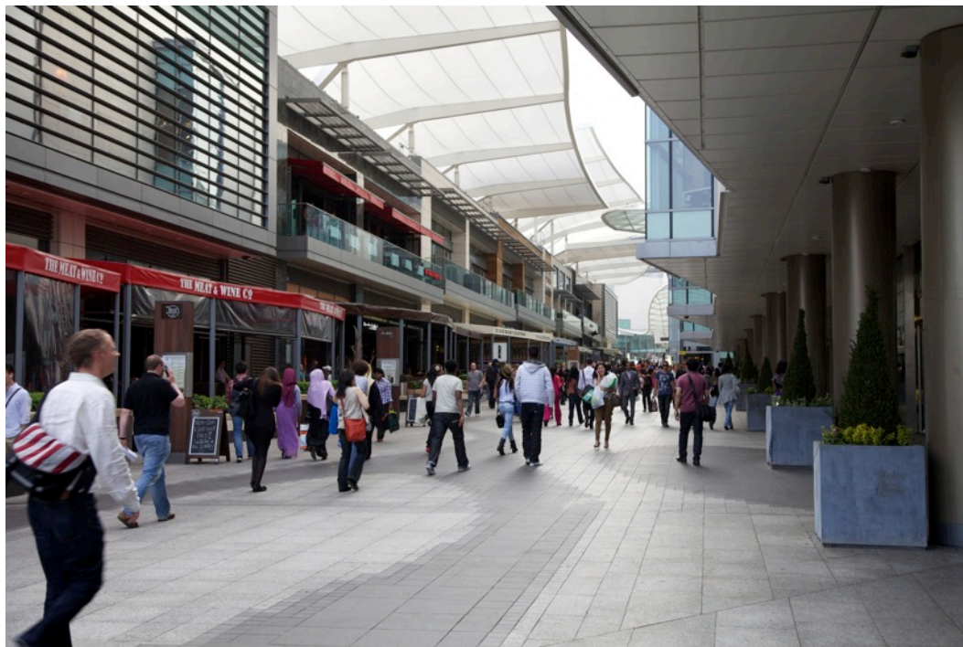
Figure 4 - Westfield London 'Southern Terrace' restaurants and entrance (Field, 2011b)

The quantity of visitors within the mall did not seem to vary greatly depending on the day of the week, with the exception of Saturdays, which appeared busier in general. During the daytime the mall was populated by a mixture of mostly females from a variety of age groups. A considerable number of people were visiting the mall alone or with young children.