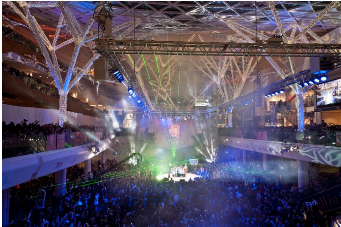
Figure 2 - 'The Atrium' – Rihanna switches on Christmas Lights (Westfield London, 2010)

The central space of the mall is 'The Atrium' (see Figure 2), a large performance and exhibition space dubbed a "world class venue" by Westfield (Westfield Group, 2008:4). Adding to the entertainment portfolio, the Vue Cinema has increasingly become a site for film premieres attracting high profile celebrities and 'red carpet' events to the mall.