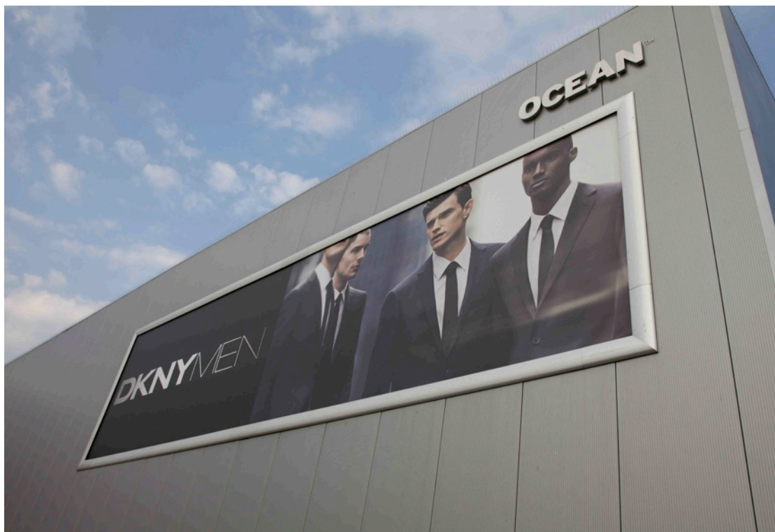
Figure 3 - Aspiring to belong - advertising board at Westfield London (Field, 2011a)

Finally, a structured questionnaire was administered as part of an intercept social survey, capturing consumers leaving the mall as a way of gauging their individual perceptions and experiences of the space. The questionnaire included a series of questions creating a summated scale, the 'perceived exclusion indicator', a measure of how excluded or included an individual felt within the space.